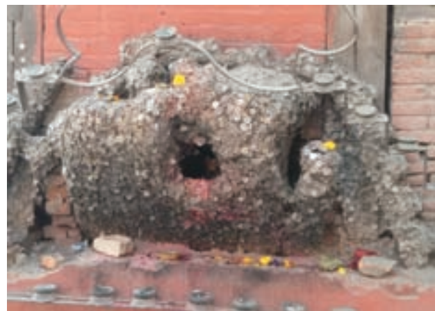
Figure 1 : Danteshwori Devi shrine, known as Washya Dyo in Kathmandu, Nepal. People who suffer from toothache visit this Tooth Fairy Shrine, nail a coin to the wood and believe that toothache will be cured by god.

Before the starting of dental schools in Nepal, a few dental surgeons were practicing in Nepal. They had received basic dental school education in other countries like in India,