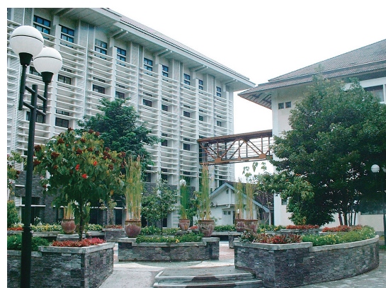
Fig.3. Faculty of Dentistry, Gadjah Mada University, Jogjakarta at present.

The other data from Riskesdas , 2007 indicated that