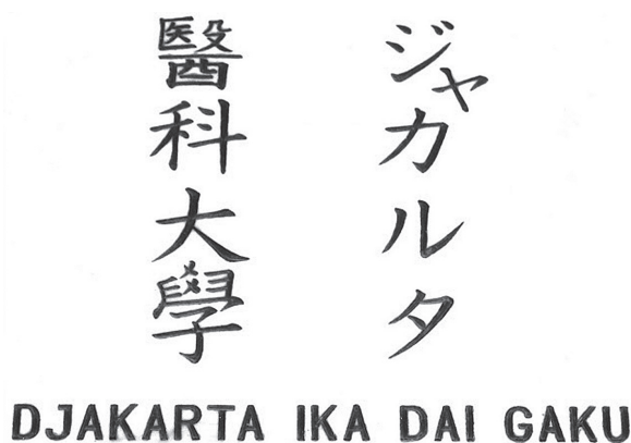
Fig.2. Symbol of NIAS 1942–1945